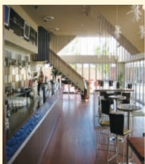
Above: Watermark Bar Below: Calamari Salad