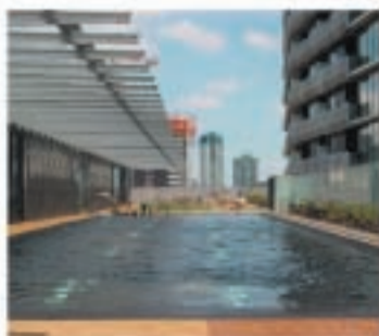
1 Bedroom Watergate $310 per week Leased in 3 days!

lucas real estate has a large number of desirable tenants seeking accommodation in the docklands area.