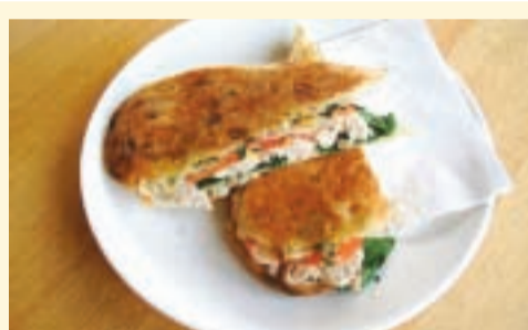
Above: Chicken Focaccia Below: Chocolate Brownie and Griffiths Coffee

At a glance, the colourful NAB building that stands tall at the start of the Vic Harbour Promenade may lead you to think this is a corporate locality, but take a stroll down to any of the five water-side eateries and you will soon see that this is far from the case. Instead I discovered stylish modern venues, interesting dishes from varying cultural backgrounds and eateries offering outstanding service with breathtaking views that stretch from The Bolte Bridge across Central Pier to the magnificent CBD skyline. There's even free two-hour parking and it's only a stones throw from Telstra Dome for pre-event get togethers or post match celebrations! This truly is an eclectic destination that all Melbournians should visit and experience.