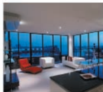
2 Bedroom Fully Furnished New Quay $700 per week Let in 5 days/Corporate Client!

lucas real estate is the only independant docklands specialist.