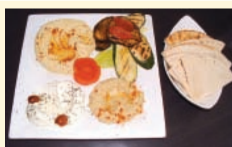
Above: Dips and Lebanese Bread Below: Falafels

One of the classic food matches with pinot is duck, what's your favourite food match with Pinot Noir and why? All entries to: inouk.m@bigpond.net.au