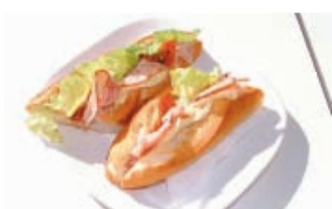
Above: Shaved Ham Baguette Below: Ginger and Lemon Chicken Salad

Open: Breakfast and lunch, Mon-Fri 7am-5pm. Contact: 9670 4484