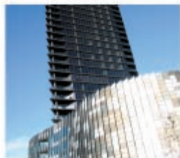
2 Bedroom Yarra's Edge Tower 5 $450 per week Leased in 8 days!