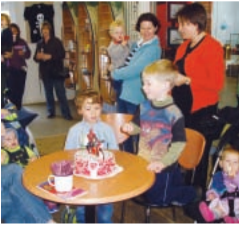
The Docklands Playgroup celebrates a birthday

To find out more about the Docklands Playgroup, contact the Community News or call Irene Wasenko on 0418 112 633