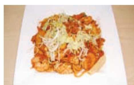
Above: Seafood Mee Goreng Below: Lemongrass Chilli Chicken

Open: Breakfast/Lunch and catering, Mon-Fri 7am- late. Contact: 9606 0077