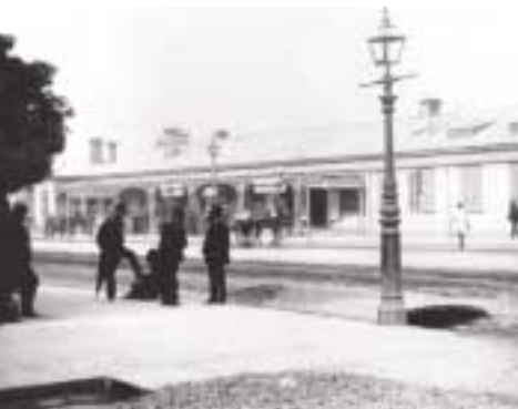
Spencer Street Station photo by J W Lindt c 1876 La Trobe Picture Collection SLV. Note the man having his shoes cleaned, the 'bridges' over the gutters and the gas lamp.