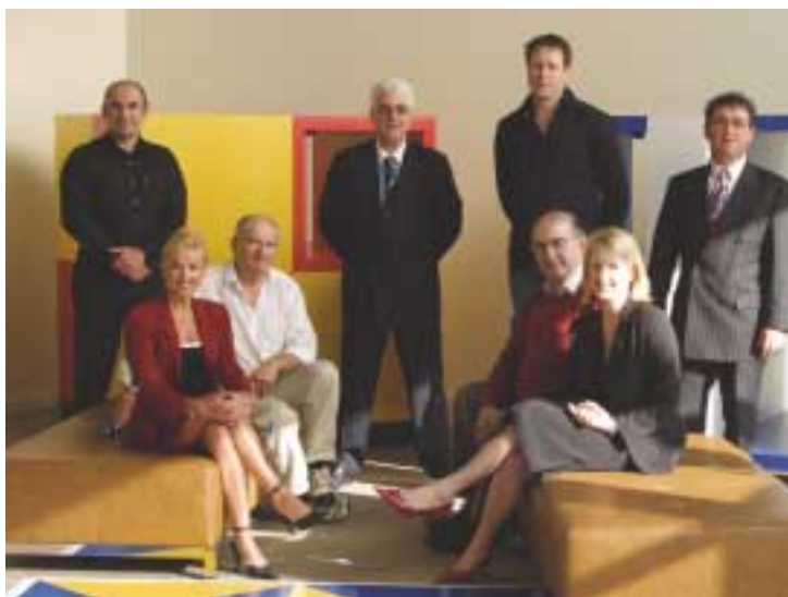
The new Committee of the Chamber of Commerce