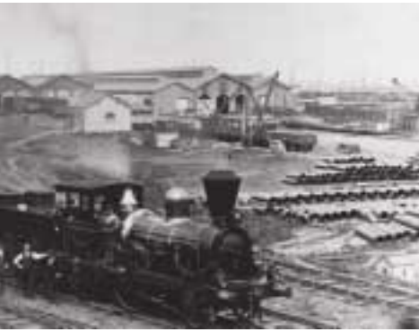
Spencer Street Railyards 1880

Like Docklands, Spencer Street is undergoing a rebirth and its new incarnation will present a vastly different setting for train travellers in Melbourne.