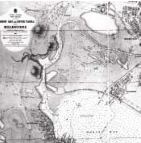
Section of Major Cox's 1864 map of Hobson Bay and the Yarra. This map shows the old course of the Yarra, the west Melbourne Swamp, Spencer Street Railway Station.