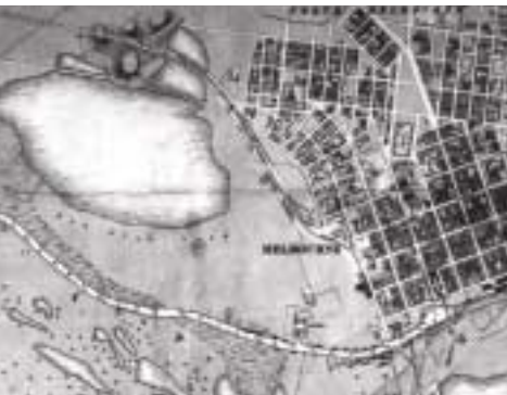
Detail of Section of Major Cox's 1864 map of Hobson Bay and the Yarra showing the present day Docklands area including the Spencer Street Railway Station and the Gas Works.